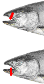
Figure 3. Placement of hog ring tag on adult (top) and grilse (bottom) fresh Chinook salmon carcasses