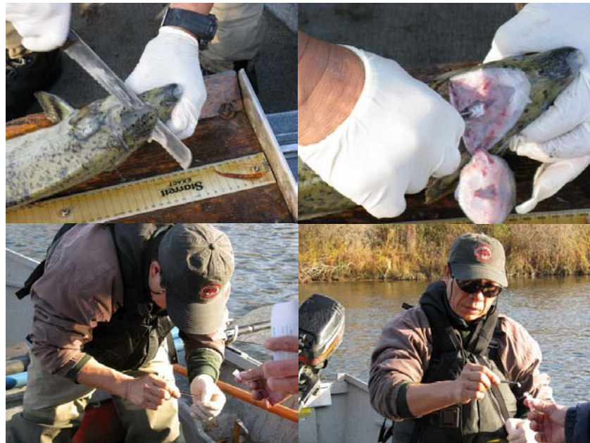
Figure 2. The “flip top” approach used to extract otoliths from Chinook salmon carcasses (Steve Tsao, CDFG, 2009).

A chain of custody form will be filled out to track possession of the otolith samples. The chain of custody form will include information such as otolith sample number, sample location, dates and time of collection, and the name of person(s) who collected the otolith sample(s). On each occasion when the otolith sample(s) changes possession, the person relinquishing the sample and the person receiving the sample(s) must sign and date/time the chain of custody form.