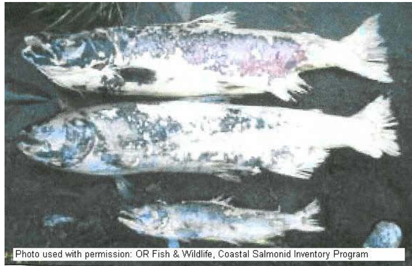
Figure 1. Male (top), Female (middle), and Grilse (bottom) Chinook salmon carcasses